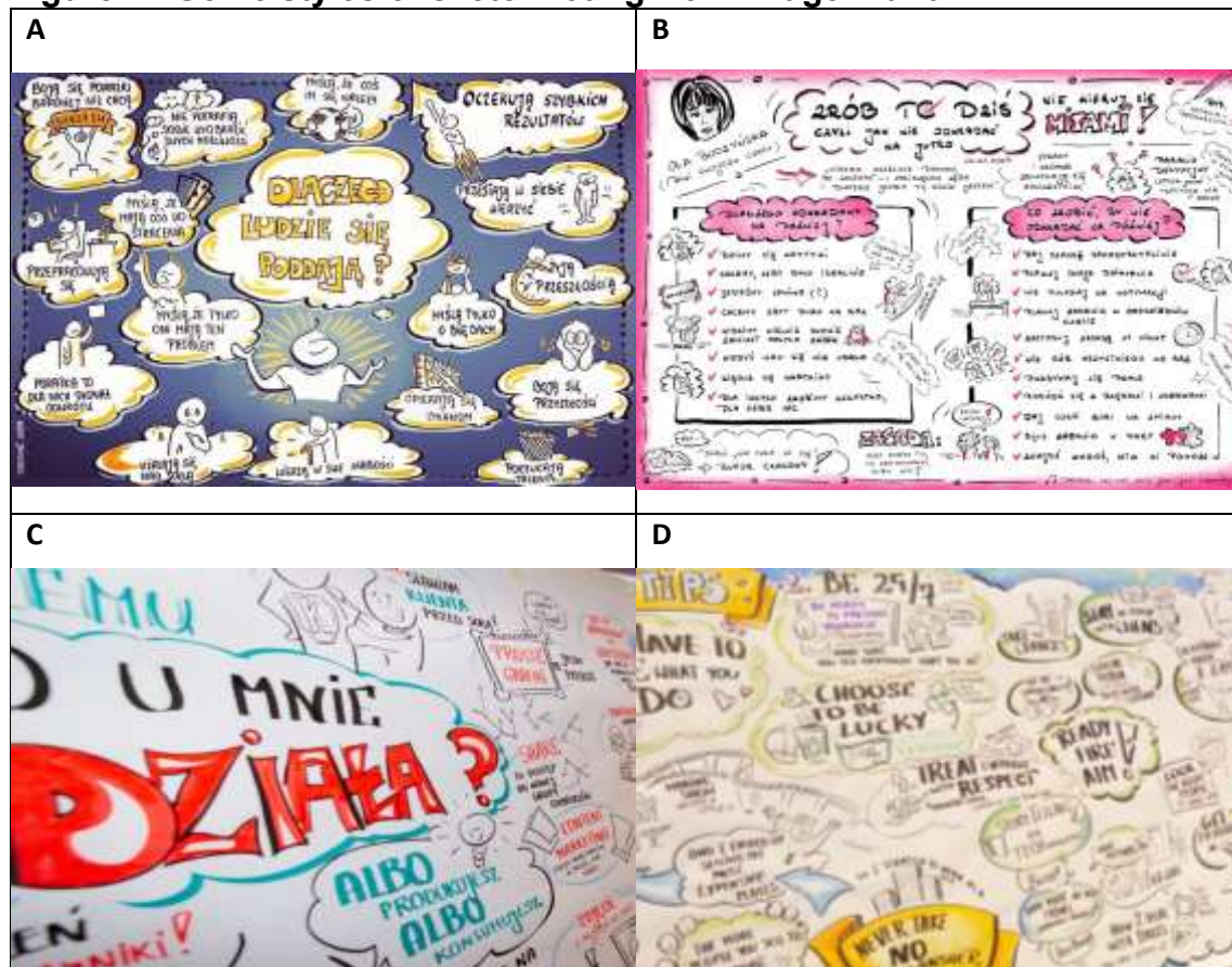
Figure 1 - Some styles of sketchnoting from image A until D.

Sketchnoting is enable to engage and remember the content by means of a few simple lines. During the workshops for educators, the useful knowledge of how to make lessons more attractive and pleasant is provided, and that results in increasing their effectiveness.